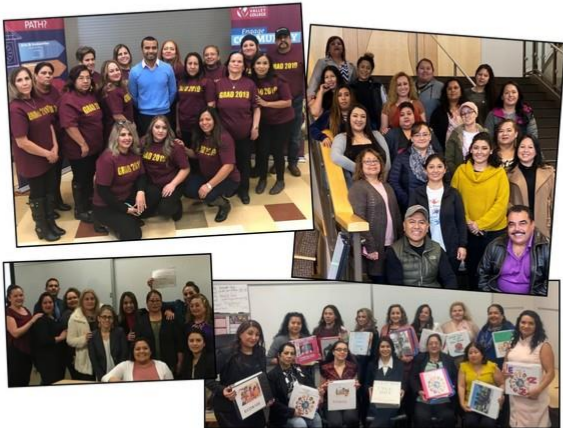
Pictured are both students from Yakima Valley College, Yakima campus as well as the Grandview campus.

These certificate programs are offered in Spanish, allowing students to learn and complete the certificate in their native tongue – how cool!