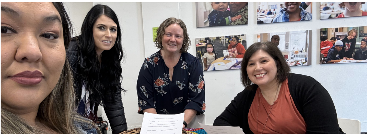
The Safe Babies team attending the graduation at Institute for Black Justice. We were able to partner with the agency to provide listening sessions in groups and individually before and after graduation.

Themes regarding access to housing that is affordable, safe, and meets the need of the family size were consistent across various communities. The additional fear expressed by parents about losing their child due to housing was another common theme. During the listening sessions, we heard feedback regarding short-term solutions for housing assistance. However, challenges with being able to sustain the cost of housing once a short-term program ended was prevalent. In some situations, families were left with no other option than to live with other family members due to the cost of living and housing availability. A challenge is that not all individuals have safe family or friends to stay with. This can cause additional concerns to maintaining custody and/or supporting reunification. Another concern was that housing programs are often located in neighborhoods where there are more frequent rates of substance use.