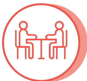
3. Peer Support