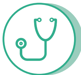
2. Health Care