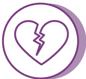
6. Domestic Violence