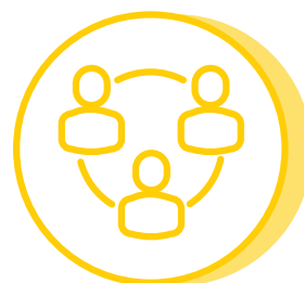
5. Service Availability for All Families