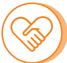
4. Relationship with Child Welfare & Service Providers