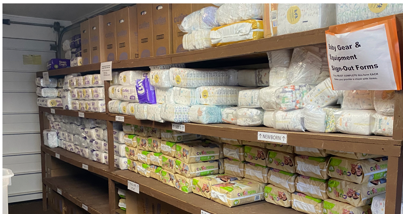
Diaper bank shelves at the First Step Family Support Center in Port Angeles.

Specific to scripting, most parents immediately reacted to the partnership with DCYF/ CPS with several commenters chuckling/ laughing and stated that in no way would they respond to someone who was in partnership with DCYF. Because the nature of this pilot is a partnership with DCYF, handling that relationship must be done carefully. A balance between being open/transparent and describing the exact nature of the relationship is key. For example, “We know it can be scary to have a call from an agency that is working with CPS, and we would like to be clear about exactly what we share with CPS and what we do not need to share.”