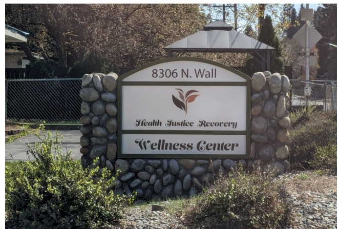
Health Justice Recovery Center co-hosted a listening session at their Wellness Recovery Center in Spokane. The homelike environment and childcare provided allowed participants a level of comfort and on-going support.