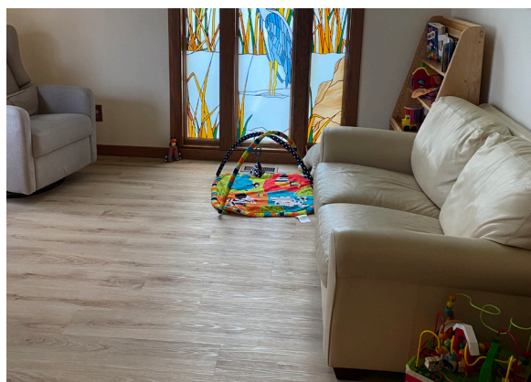
A family room at the Family Support Center in Port Angeles. This setting created calm and focus to meet with families.

Interpretation of policy was another area where differences were noted. HB 1227, the Keeping Families Together Act, was explicitly brought up at two Western Washington locations. Participants in the Spokane regional area said they wished there was some type of policy to prioritize providing supports to keep families together. This might represent a difference in the interpretation and application of policy.