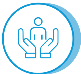
1. Treatment Services