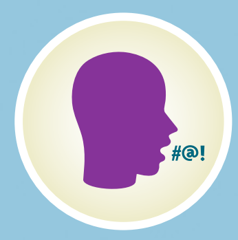
Slurred speech or not making sense