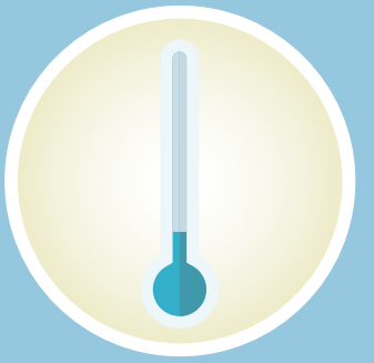
Skin feels cold and clammy