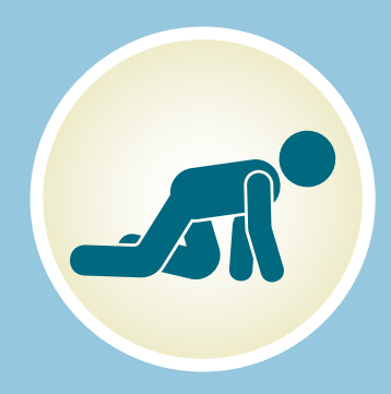
Loss of coordination (stumbling, tripping, falling down)